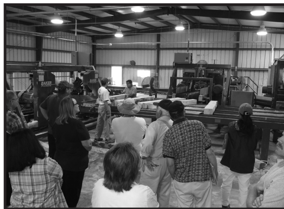
Woodland owners observe what happens to trees after leaving their properties.

Fence Company in Webster County and B&K Wood Products who have two facilities in Hopkins County. It was fascinating to see the mills in operation and to see the ways that these companies utilize the "waste" from their primary products into marketable secondary products. There is no "waste product" at either of these mills. Presentations were made concerning woody biomass and wood product markets. The Green River Logging Council gave a presentation on what a land owner should look for when choosing a logger.