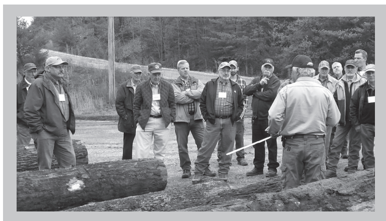
Attendees discuss log grading during site visit to H&S Lumber Mill.