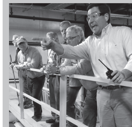
Attendees follow a single board from raw lumber to finished product at Powell County Millwork.