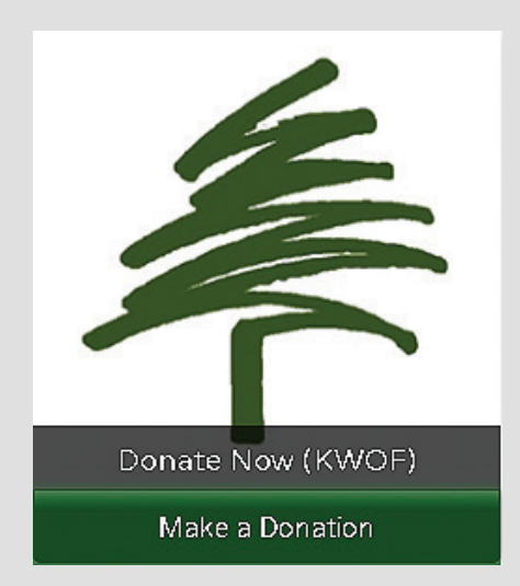
Donate to the Kentucky Woodland Owners Foundation

Woodland owners join together to improve forest management science, services, education and law. Your contribution will make sure that mission has the resources it needs to be successful.