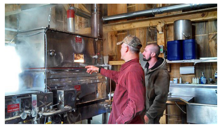
An NRCS conservationist meets with a landowner to discuss forest management goals.

Kentucky NRCS works with a whole host of partners to help forest landowners meet their woodland conservation goals. For initial planning assistance partners include the Kentucky Division of Forestry (KDF), the Kentucky Department of Fish and Wildlife (KDFW), the Roughed Grouse Society (RGS), the National Wild Turkey Federation (NWTF), and a group of registered professional consulting foresters knows as Technical Service Providers. These partners work with NRCS and the woodland owner to craft a customized, property specific forest management plan. Once a landowner has a forest management plan to help guide conservation