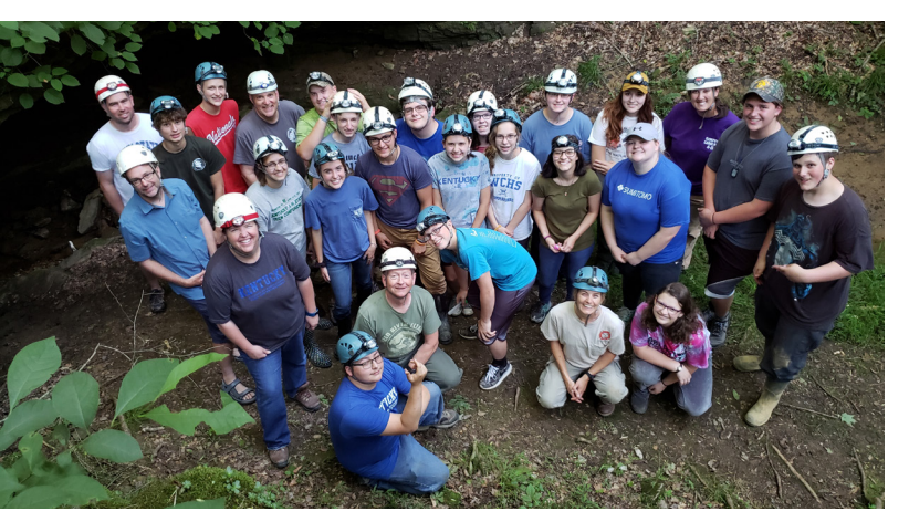
2018 Kentucky Forestry Leadership Program participants.

Congratulations to KWOA and its array of summer events. By looking at the mission statements of KWOA and KWOF quickly you will see education as a main focal point. The summer of 2018 certainly has proven the statement to be well founded.