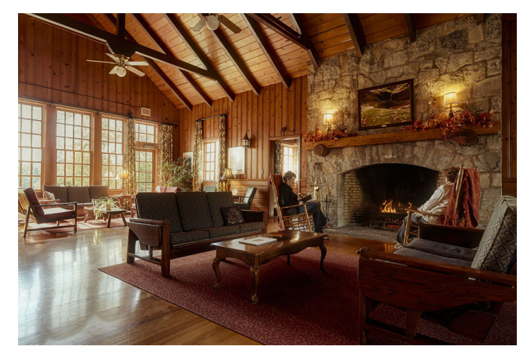
Interior view of Pennyrile Lodge at Pennyrile Forest State Park.

Members who do not have access to the internet or would prefer to continue receiving a paper copy via USPS will be able to do so for the near future. More details will be available with membership renewals for 2019.