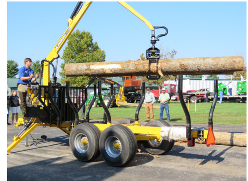
In-Service Training for County Extension Agents and Woodland Owners at the Kentucky Wood Expo