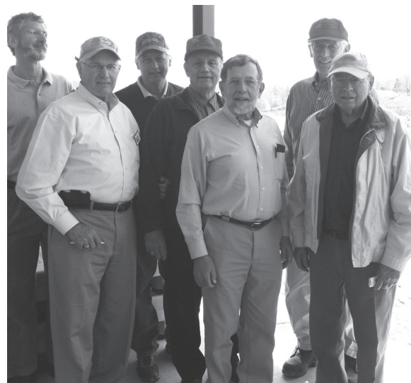
West Liberty. KWOA members attend dedication of restored Morgan County Tree Nursery. The nursery was devastated by a March 2012 tornado and slated by the Governor's office for permanent closure. Efforts by KWOA and many others resulted in restoration and improvements to the nursery that re-opened with a formal dedication on April 21.