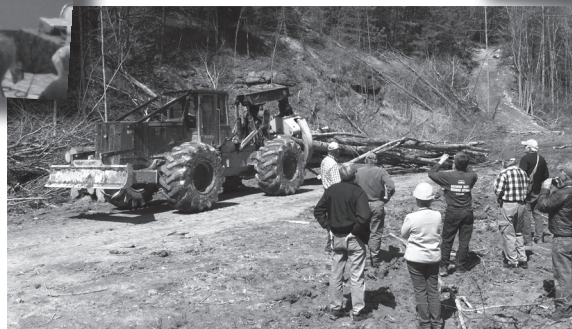
Modern logging equipment demonstrated on 2014 field trip.