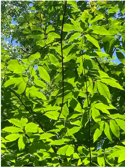
American Chestnut Leaves

If you find what you believe to be a surviving American chestnut you can report its location by using a form found at www.acf.org . Or simply use the Tree Snap App to record the tree and its location.