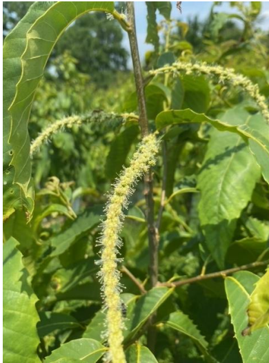
American Chestnut catkin

Be watching along the roadways & trails for these blooms.