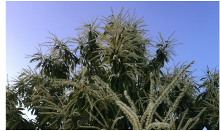
American Chestnut in bloom above. Col. Sizemore among the Chestnut leaves below.

Be watching along the roadways & trails for these blooms.