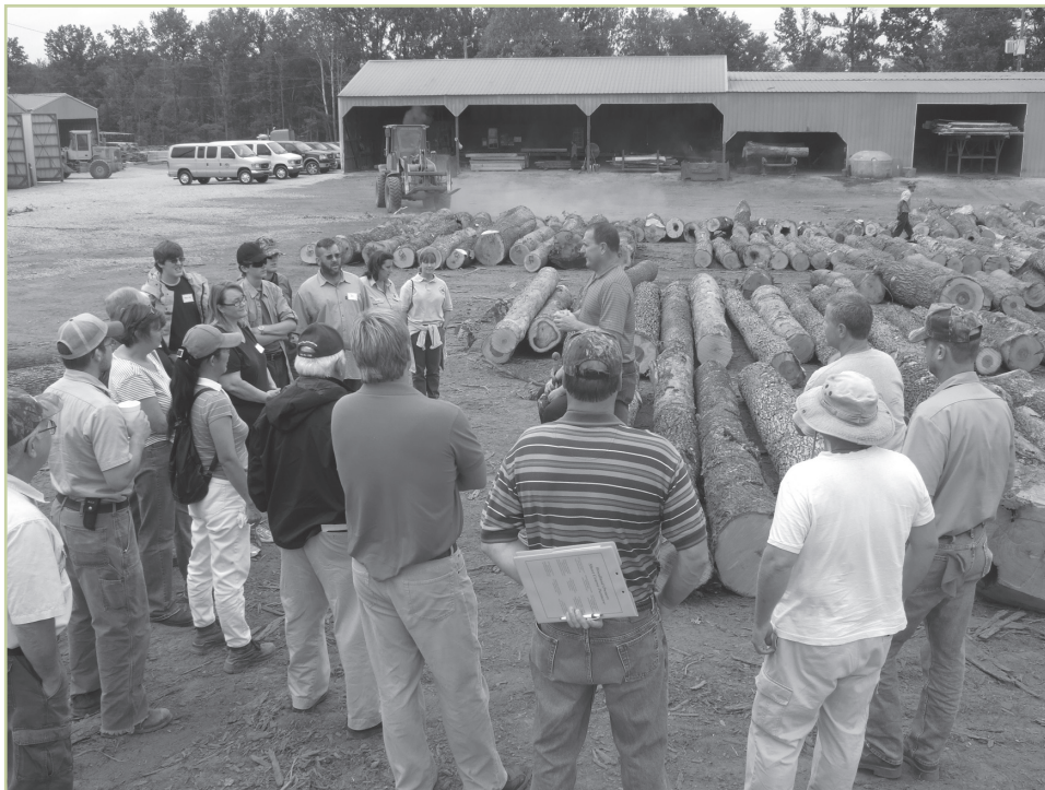
Woodland Owners Short Course participants gain insight into the wood industry.

KWOA appreciates the support of the Bradley/Murphy Forestry & Natural Resources Extension Trust for the WOSC. The Trust wishes to encourage, promote and develop through education and the free market system the stewardship of forest and related natural resources in the private sector.